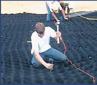
Hand Hammering: Not Perfect