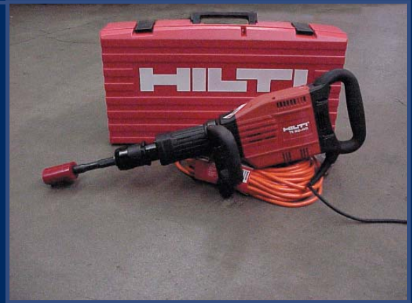
The ATRA Driver System: electric driver, cord, carrying case and specially designed ATRA gad.